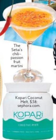
Kopari Coconut Melt, $38; sephora.com

"I'm not a party girl. I prefer to swim with dolphins."