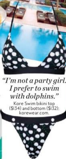
Kore Swim bikini top ($134) and bottom ($132); korewear.com

"My Away carry-on was co-designed by my sister Rashida. It has two USB chargers and a laundry bag."