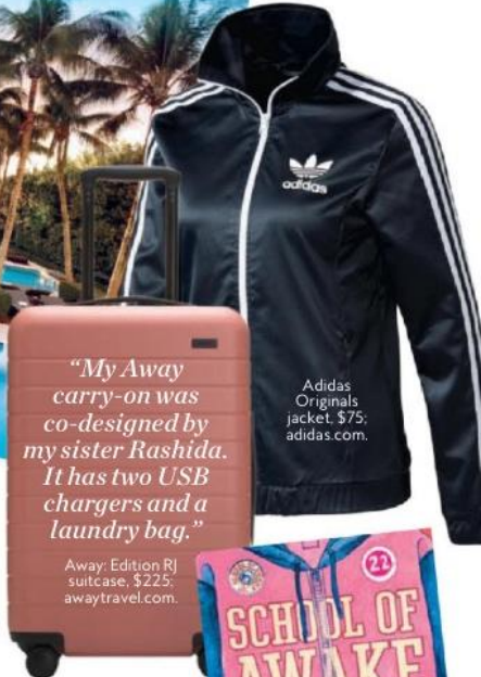
Adidas Originals jacket, $75; adidas.com