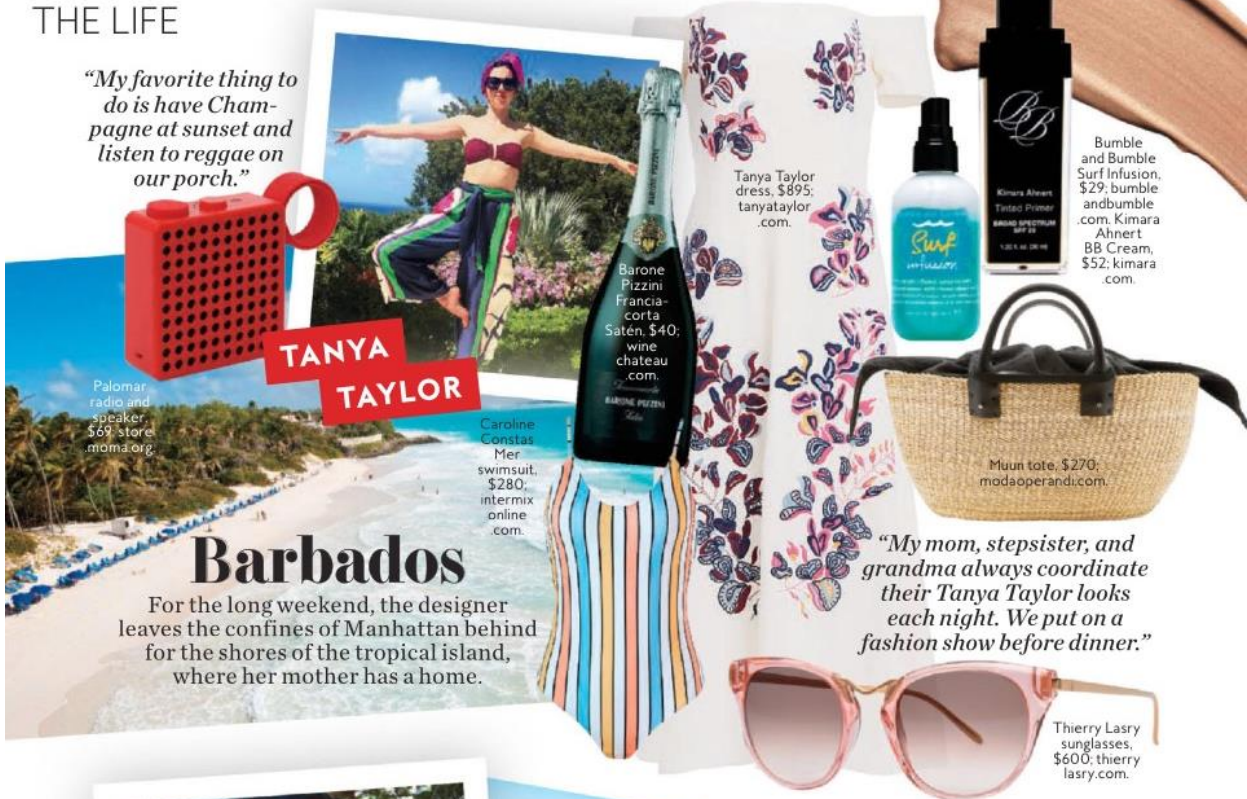
Palomar radio and speaker, $69; store: moma.org

"My favorite thing to do is have Champagne at sunset and listen to reggae on our porch."