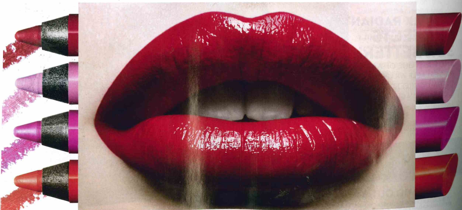
From top, left to right: Urban Decay 24/7 Glide-On lip pencils and lipsticks in 69, Obsessed, Anarchy, and Bang. Lip pencils, $19 each, and lipsticks, $22 each.